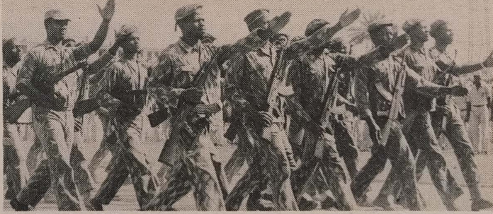
The fight for Afrikan liberation is a constant struggle which the brothers of PAIGC are committed to, as they march in the funeral procession of Amilcar Cabral.

The Executive Committee of the Struggle Conakry, January 26, 1973