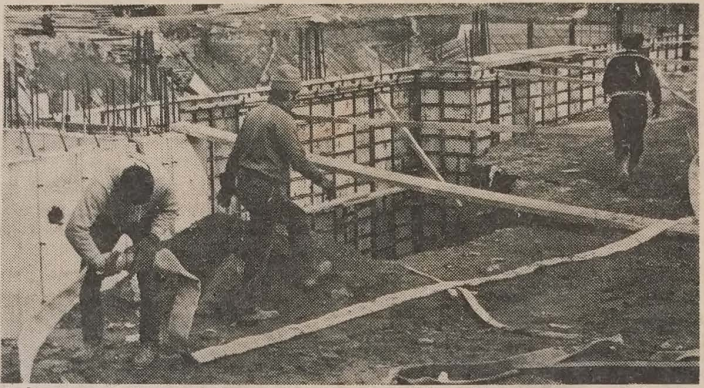
Laborers are shown at the construction site of Kawaida Towers preparing to begin work, despite the obstruction of those racist forces which said that no work would go on.