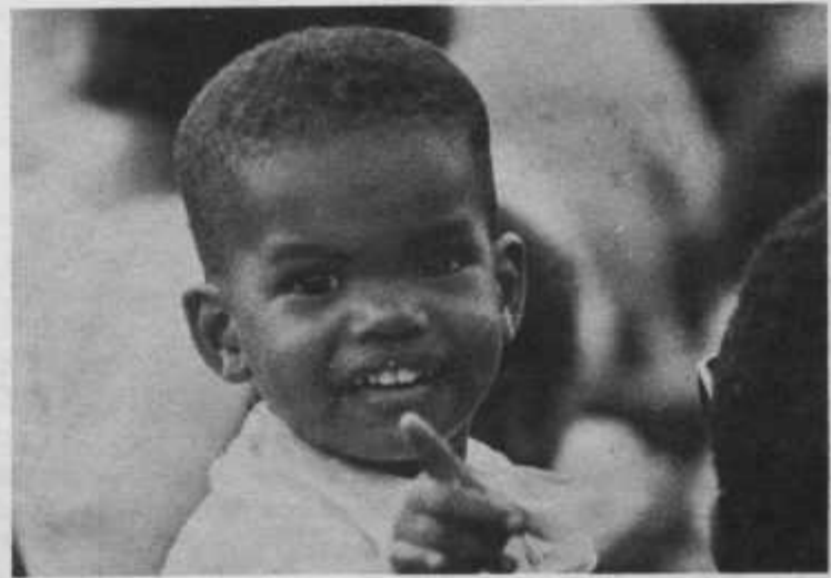
This lad's future, and the future of all Newark residents, is tied closely to the success or failure of the Model Cities program.

In addition, various other programs which are vital to the Model Neighborhood but which are funded by separate agencies and sources have already been started and will continue to serve and be enlarged throughout the Model Cities timetable.