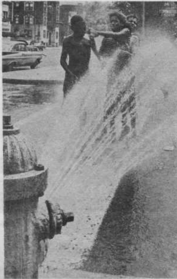
It looks like fun, but a park and a pool would be better and safer.

IS NOT . . . supported completely by Federal funds. The bulk of the funds for the Model Cities program comes from new investment of private, local and State funds, grants from exist-