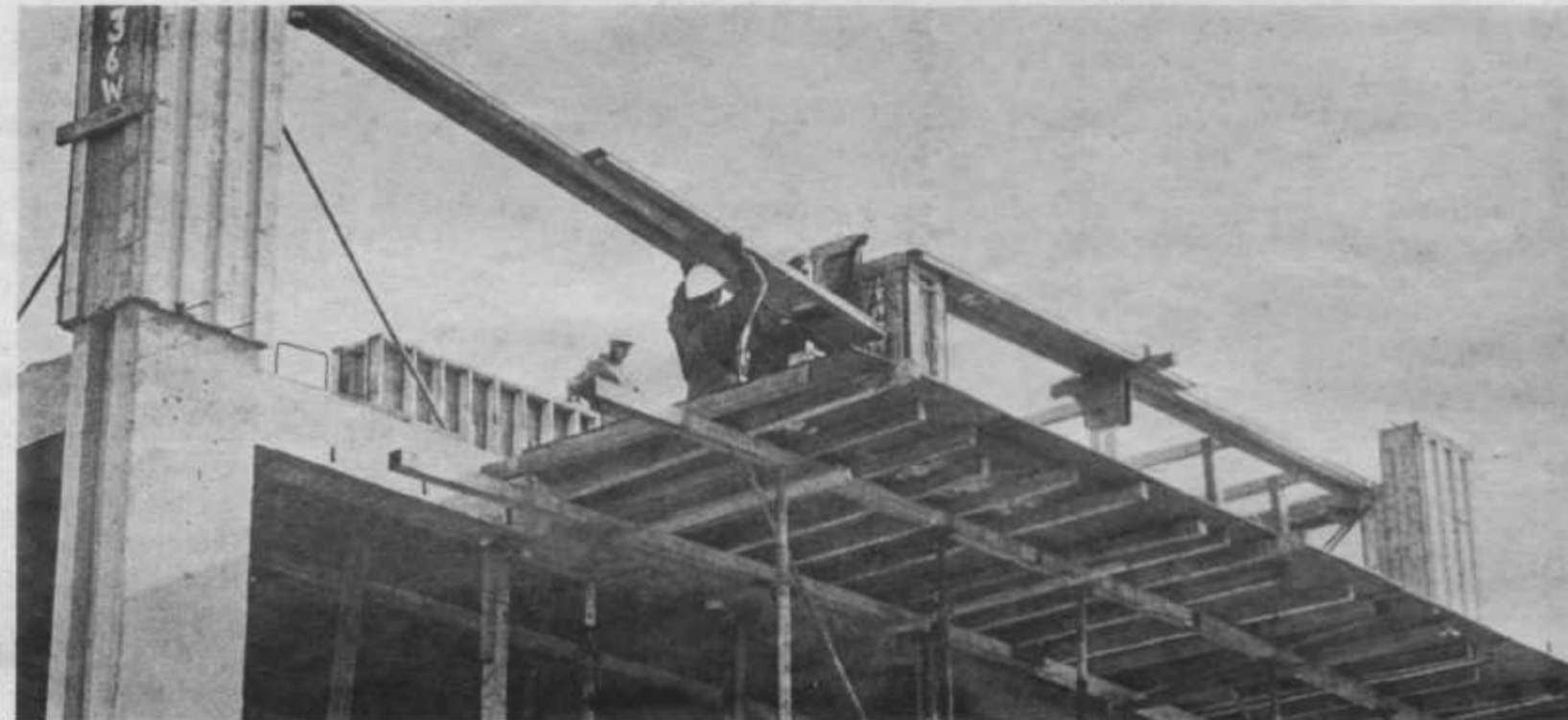
52-member Model Neighborhood Council forged citizen plans for housing construction like this low-income site on Sussex Ave.

The Model Neighborhood Council represents the citizens of the target area in planning and decision-making in the Model Cities Program. The 52 members were elected last summer when 6,000 persons came out to vote in a neighborhood election called by federal officials the most successful in the nation. Half the council was elected for two-year terms, the rest of the seats—26—are open in the election scheduled for Wednesday. The Council insures that the voices of the citizens are heard clearly. The Council carries the power to veto the programs the neighborhood doesn't want as well as approve those it does.