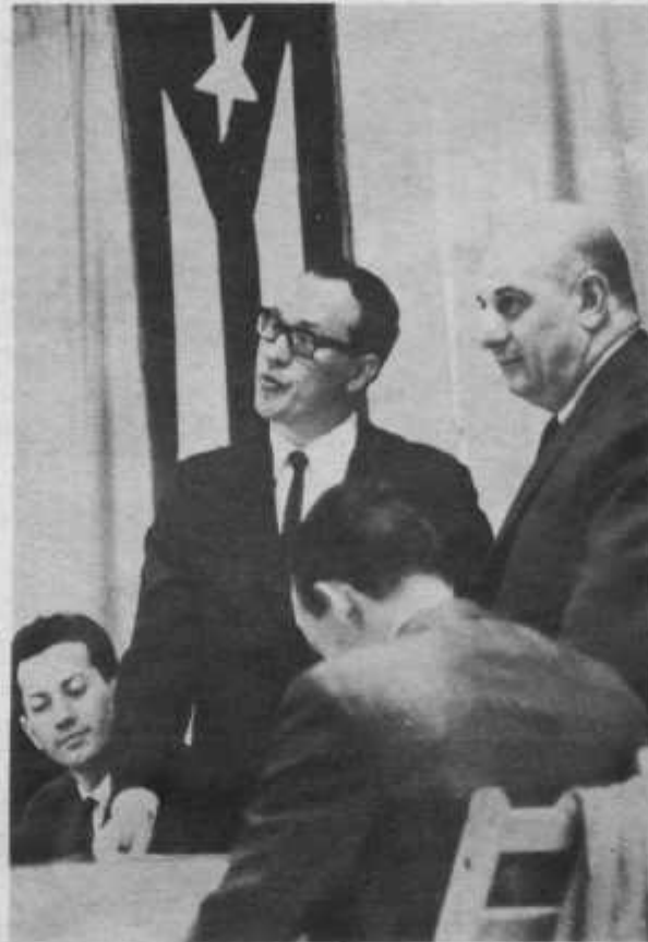
La Ciudad Modelo de Newark incluye el grupo mas grande de ciudadanos de habla Espanola de la ciudad.

Alcance Metropolitano: El programa de las Ciudades Modelo se encamina a mejorar la zona seleccionada y contribuir a un mayor bienestar y equilibrio en la ciudad y en toda la zona metropolitana. Debe tambien contribuir a un mayor desarrollo de las capacidad del gobierno local para afrontar problemas generales urbanos