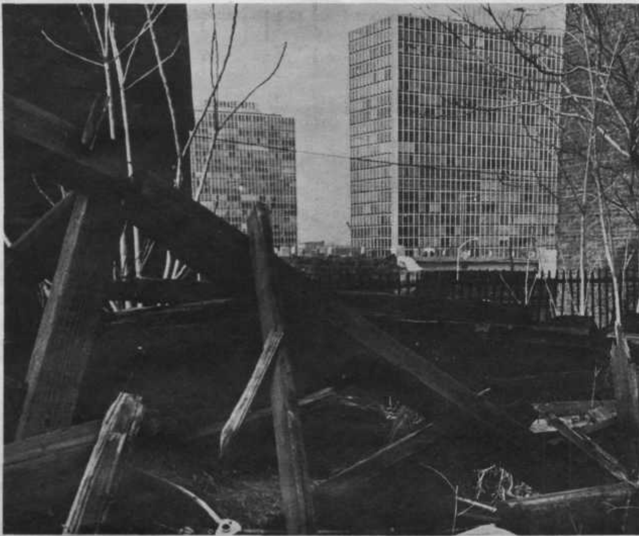
The old and the new . . . step-by-step renewal with adequate relocation and advance construction is foreseen in Model Cities.