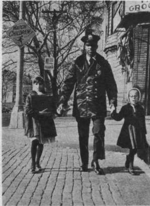
Increased use of young police cadets and citizen trainees, such as this young man, now a full member of the Police Department, is part of the Model Cities plan.

• Modernize and restructure police personnel policies through study and revision of recruitment and training standards, with special attention to testing and evaluation of candidates; establishment of a new entering position of "police aide"; extension of the employee probation period; recruitment of minority group members and Model Neighborhood residents; emphasis on the study of minority-group history and culture; and provisions of further incentives for college level study.