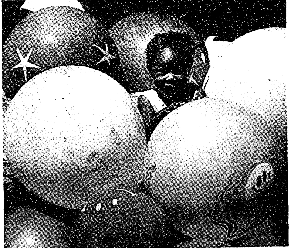
When hers burst, the vendor reached into his bouquet for a replacement.