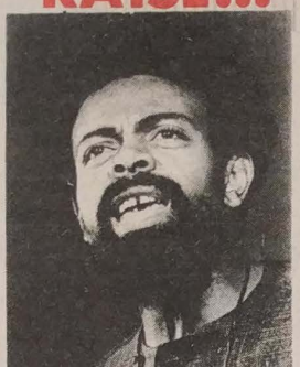
Imamu Amiri Baraka

Apparently, for the white "left", Revolutionary Nationalism, and Pan-Afrikanism, have proved to be formidable enemies. Why this is, is perhaps not obvious to people who haven't thought about it before, but, for those of us a long time in the movement for National Liberation, it is very obvious. The white "left", like most whites, are addicted to the domination of colored peoples. White supremacy is an international sickness, and it shows itself whether the particular white folks pushing it call themselves "Left" or Right wing, or Democrats or Republicans.