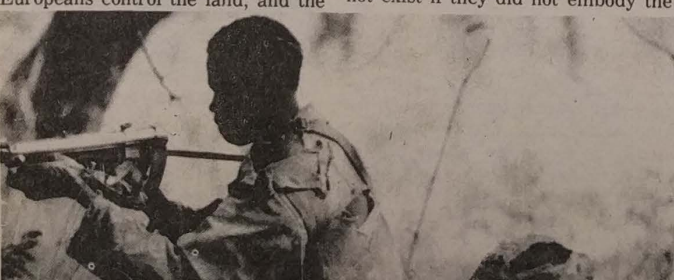
The struggle for Afrikan Liberation in Angola is one of armed struggle, as shown here by the MPLA guerrilla.

These liberation movements could not exist if they did not embody the