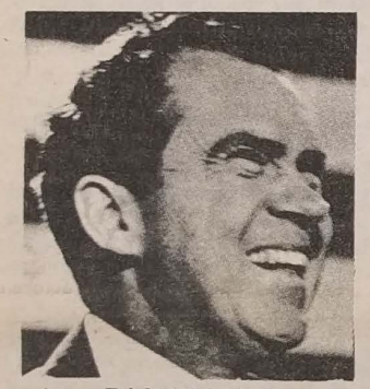
Tricky Dick Nixon "Hitler" Revised. . .Nov. 7th, 1972

The outcome of the 1972 presidential election should provide an obvious conclusion as to what Black people in America must do. The fact that neither party represented Black people makes it crystal clear that the Black nation is in desperate need of a national Black political