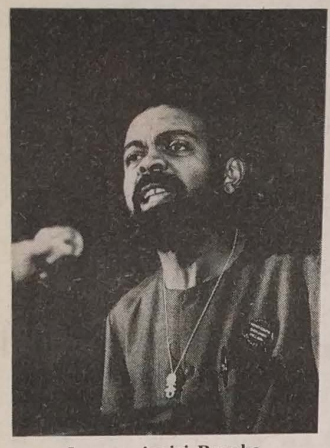
Imamu Amiri Baraka