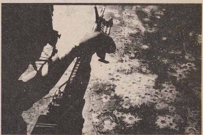
A B-52 Machine Gunner flies over the scale view of Hanoi, in an attempt to inhumanely murder the self determining North Vietnamese people. . . .

WHITE COUNCILMEN BONTEMPO, GIULIANO & VILLANI UP FOR . . .