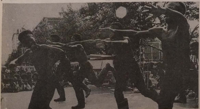
The Super Simbas are seen performing the "Boot Dance" at the Nation Time Festival in Harlem to a crowd of several thousand Black people.

Some of the Kujitegemea (self reliance) projects that the Super Simba are involved in are: