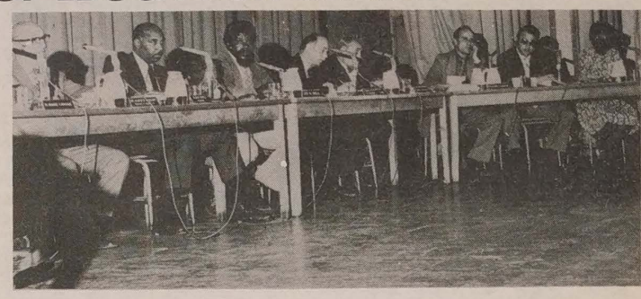
Shown are the "reactionary" Board of Education members who are constantly stifling the welfare and educational needs of Black and Puerto Rican children.

Contract talks between the Bd. of Ed. and the Newark Teachers Union (N.T.U.) highlight the need for serious consideration leading to answers and, if necessary, solutions to this question. Contract negotiations opened under the new Bd. of Ed. policy of "rotating" monthly board meetings whereby the meetings are no longer held at the Board of Education but are now (despite strong community opposition) inconveniently held at different schools throughout the city. Who would benefit by public board meetings held at East Side High School and Barringer High School during this critical contract negotiations period-or is this just a coincidence? This coupled with the fact that the, for