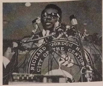
Mayor Richard Hatcher

that Black children are unable to learn unless they are in the same setting with white children; and further we disassociate ourselves from the positions put forth by Nixon or Wallace.