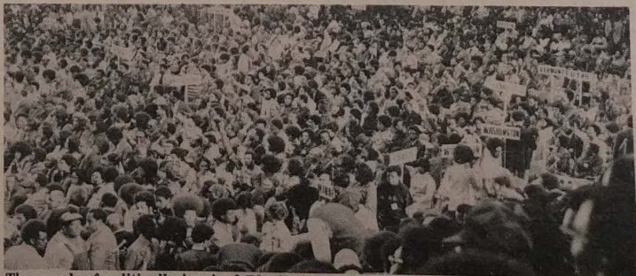
Thousands of politically inspired Blacks jammed the gym at Gary, Indiana West Side High and enthusiastically participated in the floor proceedings.

EXTRA: Text of final National Black Political Convention Resolutions on ISRAEL & BUSING.