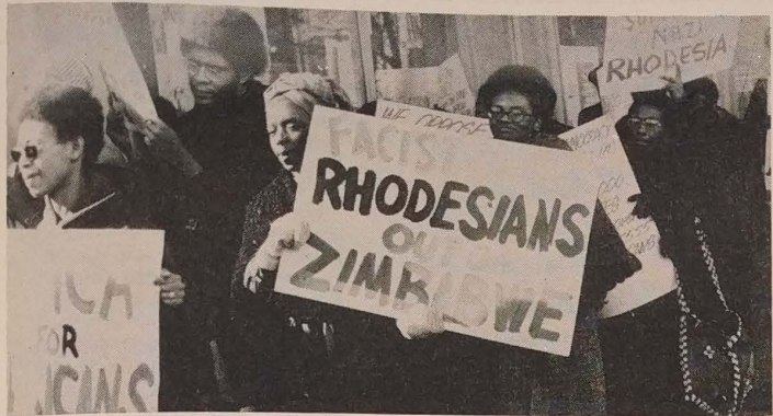
Brothers and sisters demonstrate in support of African liberation struggles on the continent.