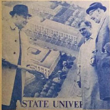
A TRUE BEGINNING — Mayor Addonizio, whose Congressional committee wrote the urban renewal laws, got our lagging building program off the ground. There was $100 million worth of construction completed or underway last year and another $100 million this year — amounts which in each case double the record of any previous years in Newark's 300-year history. HJA cut the talk and produced action among sponsors, financiers and builders. He also initiated the first program in the city's history for seizing and demolishing neglected and unsafe buildings.