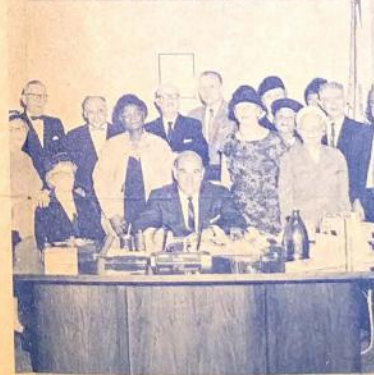
THE OPEN DOOR — The Mayor likes people, and people like him. He pledged to replace the City Hall Iron Curtain with an open-door policy . . . and he redeemed that pledge like no other man in politics. In his four years as Mayor, he has seen personally some 30,000 men and women in his office.