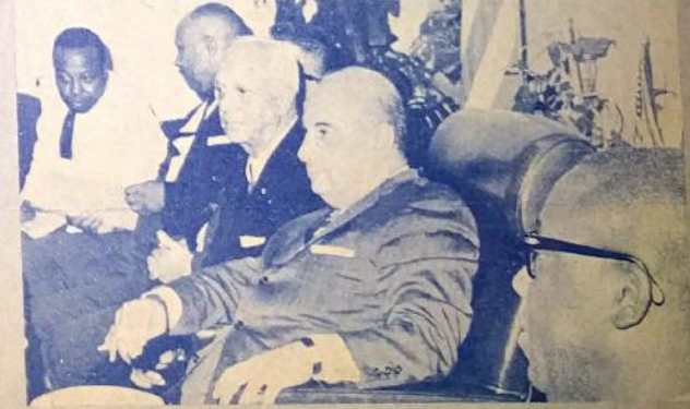
WORKING FOR A PEACEFUL CITY — The nation's eyes were fixed on Newark as riots ripped Harlem, Philadelphia, Watts, Jersey City, Paterson and Elizabeth, but open and free communication and hard, face-to-face bargaining during many tense situations, such as the one pictured, kept our city proud and peaceful. Peace in our town is a tribute to all the people of Newark, and to the Mayor who leads them. Would you really trust the safety of the city in the hands of one of the other candidates?