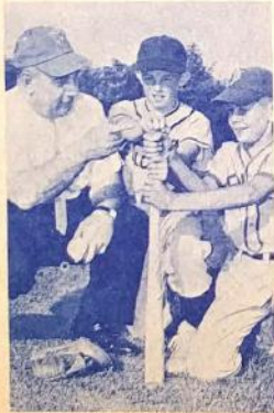
A MAN WHO CARES — The Mayor has invested in the youth of our city. He brought Newark the first Neighborhood Youth Corps in the nation, the first summer black recreation program, five federal youth programs to help 2,500 drop-outs, and $10 million in special school programs for improved reading, writing and recreation. There was not a single special youth program in Newark before HJA took office.