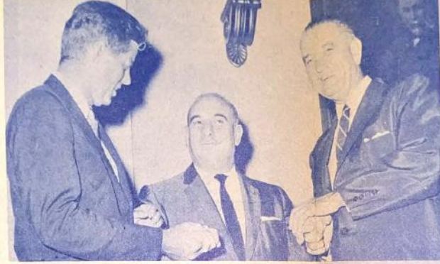
WELCOME WITH THE BEST — The Mayor here shown with Presidents Kennedy and Johnson, both of whom hailed HJA's leadership in Newark. The Mayor built respect during his 14 years in Congress. He can count on men in high office for help in programs that benefit you and all the people of our city. $35 million in federal programs since he came to office here proves it.