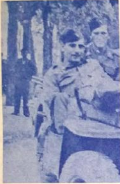
HE SERVED PROUDLY — Hugh Addonizio answered his country's call early during World War II and served for 5 years as an Infantryman rising from private to captain. Participating in eight major campaigns in Africa and Europe, Captain Addonizio was awarded the Bronze Star and his name placed in the Infantry School Hall of Fame.